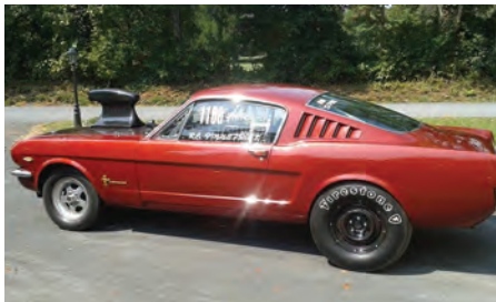
1965 Ford Mustang 2+2 Rick and Cathy Finnefrock