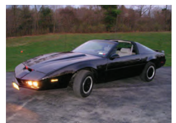
Knight Rider "KITT" TV & Movie Cars For Hire