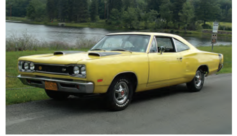
1969 Dodge Super Bee Stanley Sipko