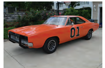
Dukes of Hazzard (used in TV show!) 1968 Dodge Charger Jim Sirotnak