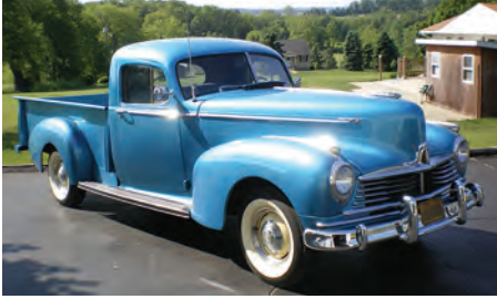
1947 Hudson Pickup Larry Creasy