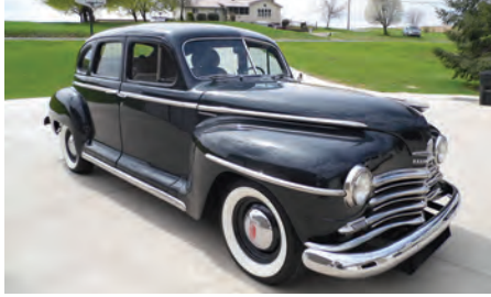
1948 Plymouth Special Deluxe Wayne Varner