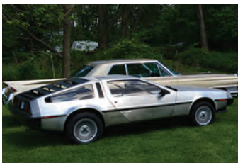
Back To The future 1981 DeLorean DMC12 Joshua Sigman