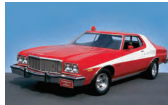
Starsky & Hutch (used in TV show!) 1976 Ford Gran Torino Steve Bordi